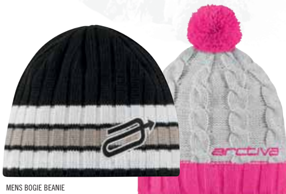
MENS BOGIE BEANIE