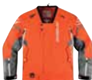
ORANGE W/ NKBR*