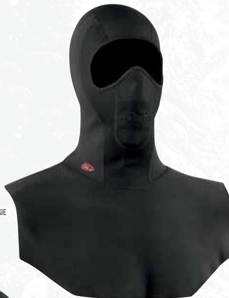
WINDSHIELD® PSP BALACLAVA W/DICKIE