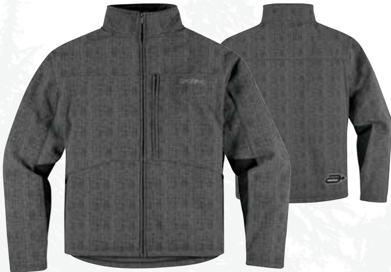
DOUBLE L SOFT SHELL JACKET