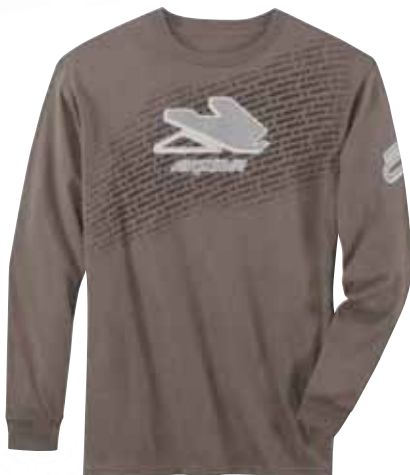
MEN'S DERBY TRACK LONG SLEEVE TEE