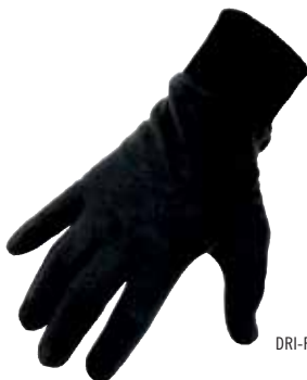
DRI-RELEASE GLOVE LINERS