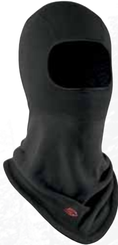
DRI-RELEASE LINER GUARD