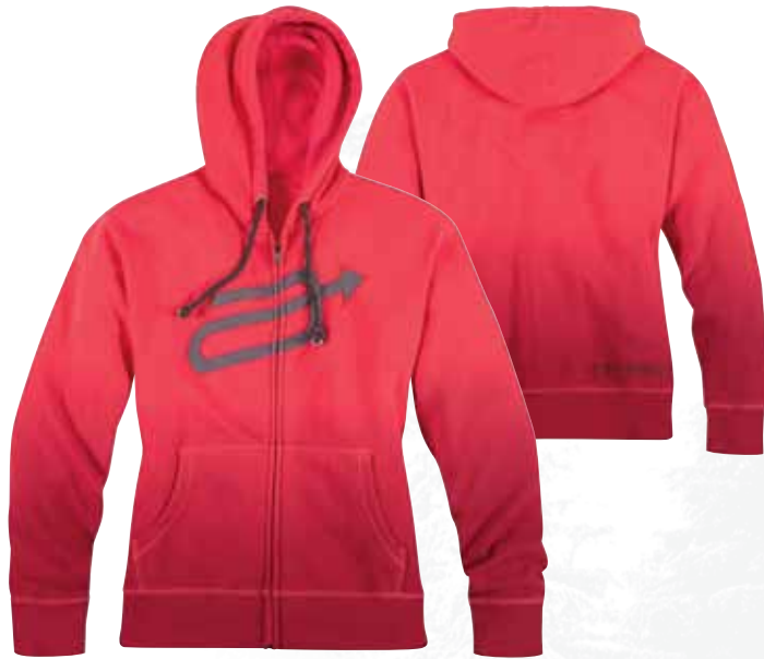
CORPORATE WOMENS HOODY