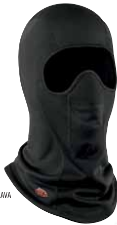
PRO STRETCH PLUS BALACLAVA