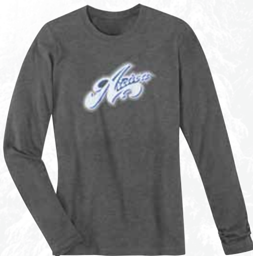
WOMEN'S GLOW LONG SLEEVE TEE